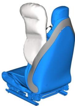
Head thorax sidebags as standard