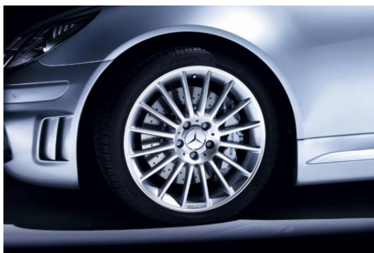
SLK 55 AMG Standard Alloys