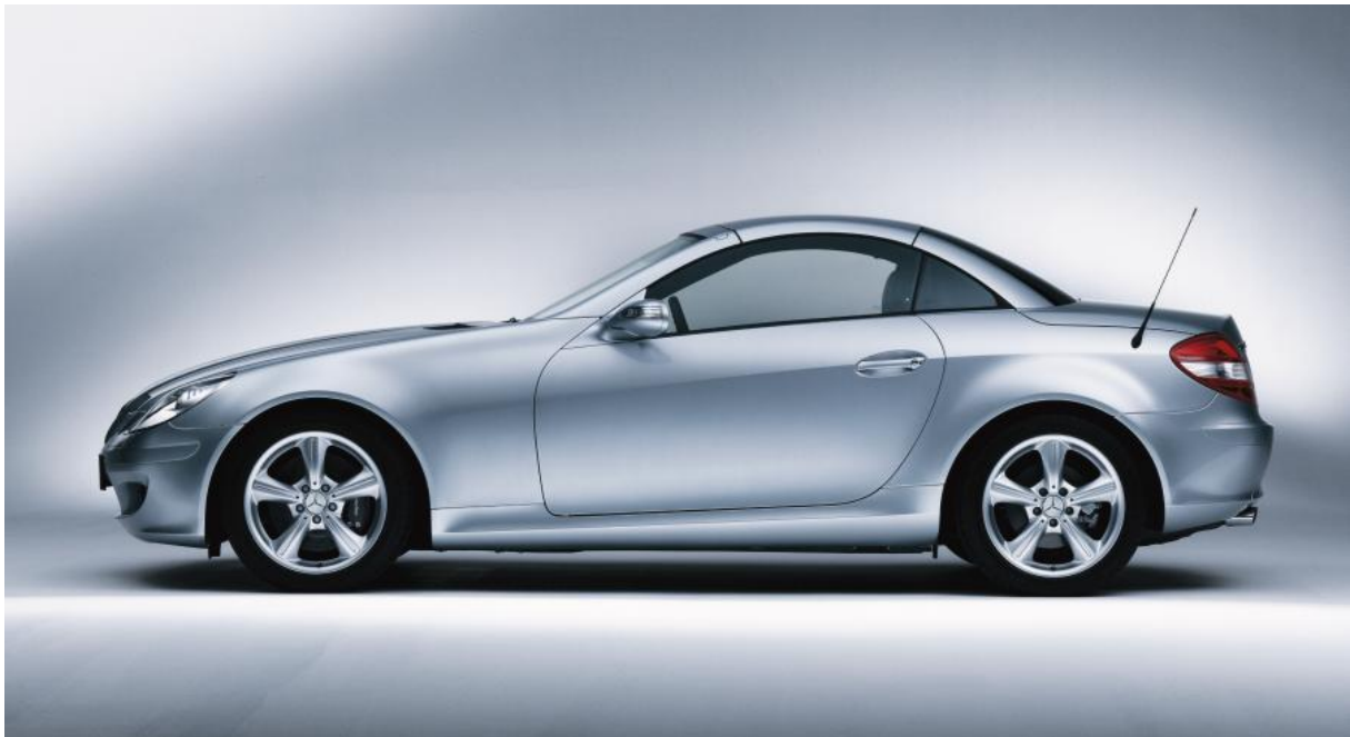
SLK 350 with standard alloys or alloy code 607, 17"