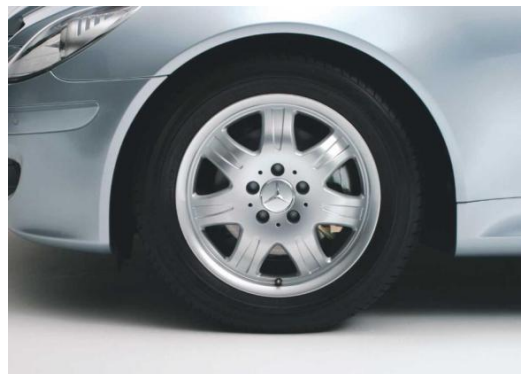
SLK 200K Standard Alloys