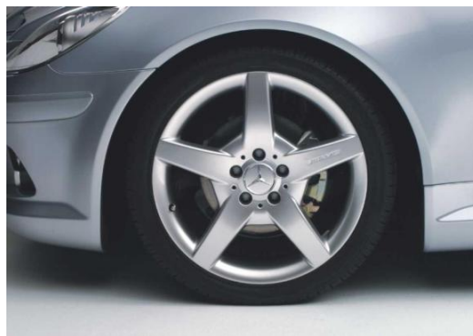
Code 782 AMG Optional Alloys